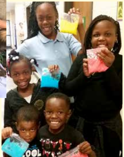
Walbridge STEAM Academy