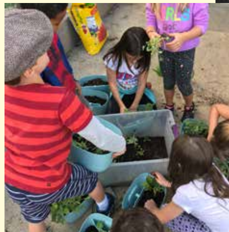
The Soulard School