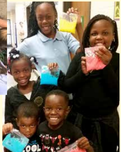
Walbridge STEAM Academy