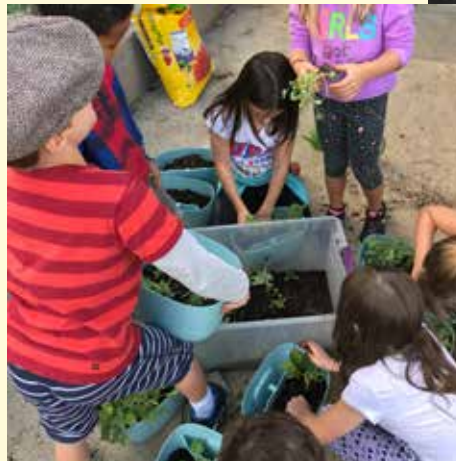
The Soulard School