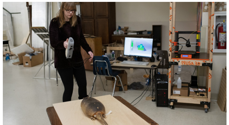
The Fulton School

Sister Thea Bowman Catholic School (Parochial) "Operation Green School" will provide students with experiential learning using opportunities with a project-based approach to green buildings, sustainable/alternative energy and green practices. Key areas of study will include solar, wind, biomass, waste water reduction and building energy efficiency. As the students apply their learnings, they lead change in their school, homes and community.