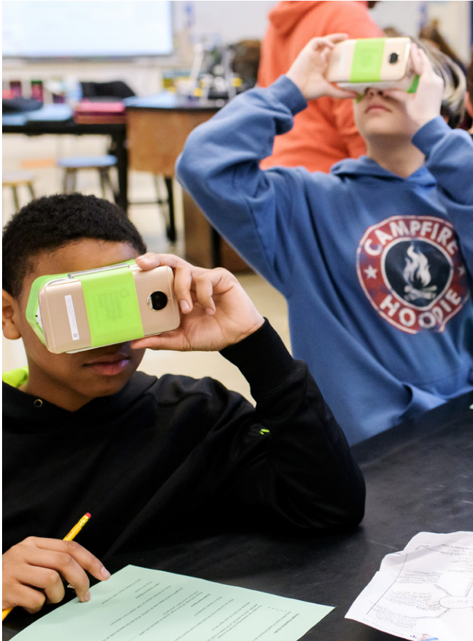
Margaret Buerkle Middle School

ITEF awarded a total of $209,992.00 in Innovator Grants to four area schools in 2019. These competitive grants are provided to allow schools in our region to create cutting edge, inventive learning opportunities for their students. The four schools received their grant awards during ITEF's 'Art of the Possible' event that was held at The Sheldon Hall on April 18th, 2019.