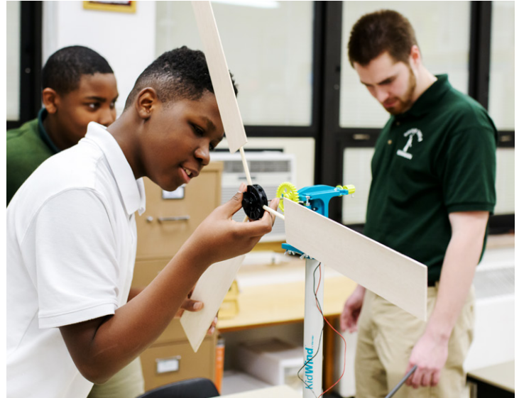
Hodgen Tech Elementary

Notre Dame High School (Parochial) By initiating a "Varsity E-sports Lab", these young women will compete in tournaments as one of the nation's few all female teams and first in Missouri in high school E-sports. The lab will encourage the students to be computer scientists and inquisitive problem solvers; it can foster and shepherd students towards careers such as STEM where opportunities will continue to grow. Esports is projected to become a $1B industry in 2019.